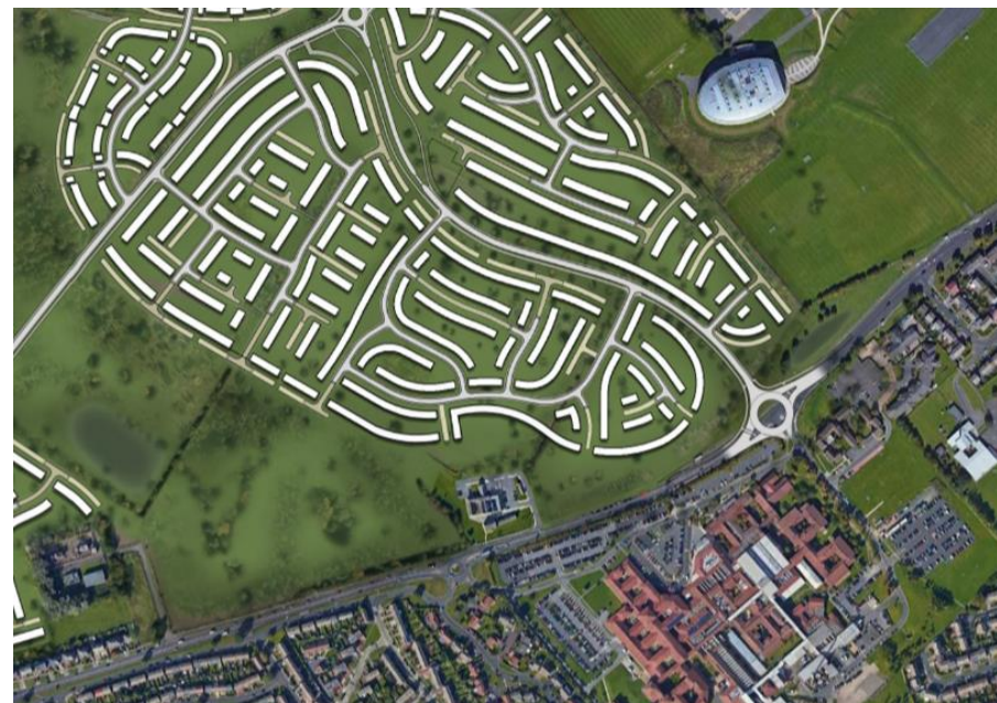
Proposed final Masterplan