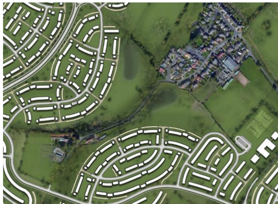
Proposed final Masterplan