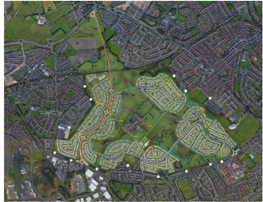
Proposed final Masterplan