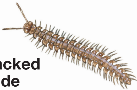
Flat backed millipede

2 pairs of legs per body segment 41 – 55 segments