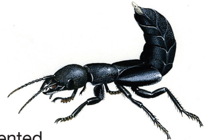
Devil's coach horse beetle