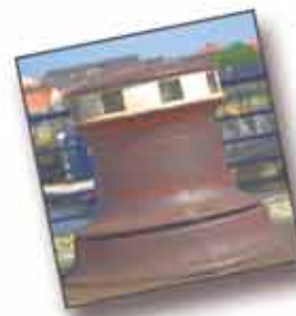
This display was created by the artist Gilly Rogers

At each end of the island stands an original capstan, one with white feathers in the resin blocks and the other with clay pipes. Also note the men's rugged brogues at the seaward end and the ladies' stilettos at the marina end symbolising where people used to stand and dream.