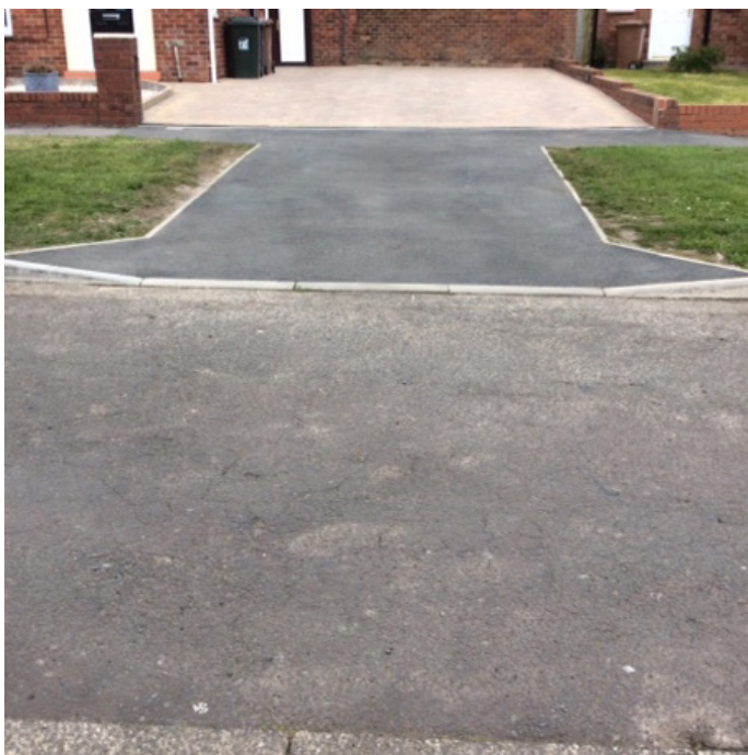
A single vehicle access crossing

A double-width vehicle access crossing has a maximum width of 7.3 metres (6 centre kerbs plus 2 sloping transition kerbs either side). This size will only be permitted if it has been assessed as not being detrimental to on-street parking capacity. If two adjoining properties share a hardstand and a double-width vehicle access crossing is sought, you and your neighbour must request permission.