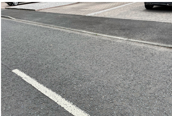
A double-width vehicle access crossing