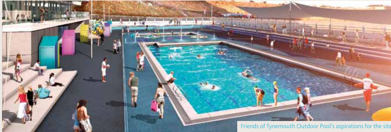
Friends of Tynemouth Outdoor Pool's aspirations for the site